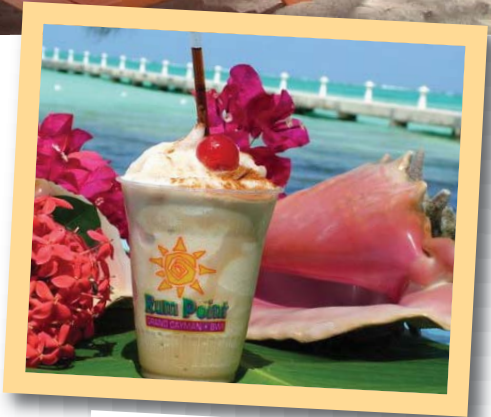
Rum Point's famous Mudslide