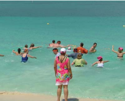
A popular group beach game in action 'Ping Pong Panic'.