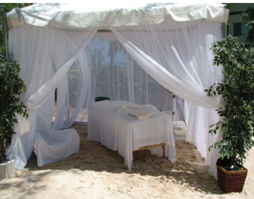
Massage services available for groups to unwind and restore the mind.

Custom-designed team building activities.