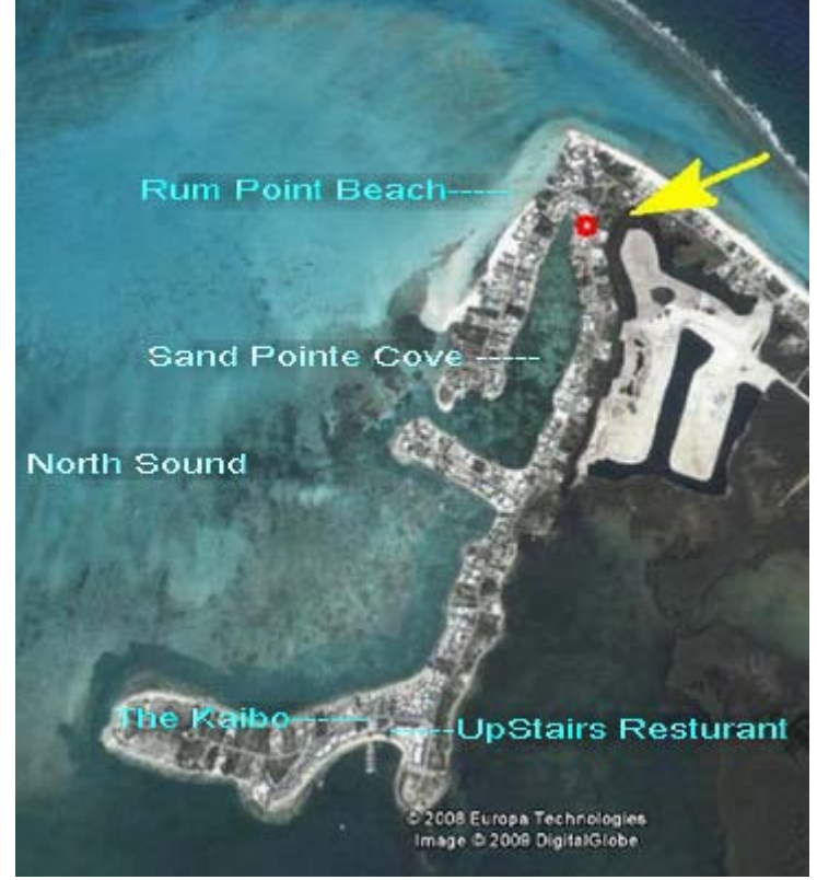
How about turtle grass and "ironshore" ... is there any or is the beach area clear? Here is another view at a closer zoom.

The prevailing winds are from the east-northeast and their approximate direction is shown by the yellow arrow. The Island Houses are marked by the red circle.