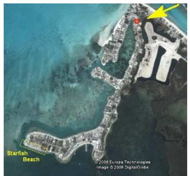
{Island Houses marked by red circle.}

This beach along the southern side of Water Cay is known for usually having several starfish visible in the water. It is about 1.4 miles from the Island Houses. To get there, from the Island Houses turn right (south) onto Water Cay Road, follow it down all the way past Camp Road and The Kaibo and continue on (west) till you get to the end of the road in Ivory Kai Point which is still mostly undeveloped land. Walk over to the beach at the point on your left hand side, and if you keep a sharp lookout in the shallows you can usually spot one or more starfish. You may need to wade out a bit into the water, and head back toward the east along the beach (back towards The Kaibo direction), but usually somewhere along there you will spot a starfish grazing on the sea bottom – maybe several!